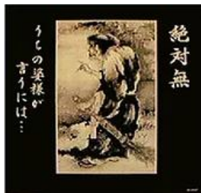
1989 (Vinyl) My Grandma Says... Zettaimu's 1st album