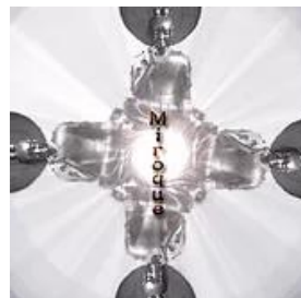
2007 (CD) Miroque Zettaimu's 5th album *MUSEA (France)