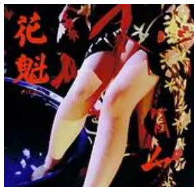
2005 (CD) Oiran Zettaimu's 4th album