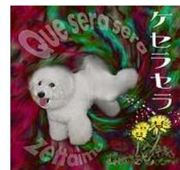
2014 Que Sera Sera