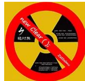
2017 (CD) new Clear( ) Zettaimu's 6th album