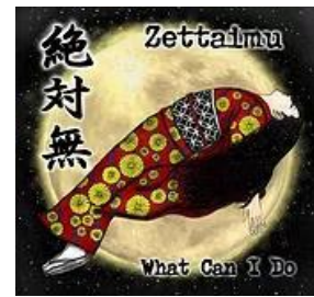
2003 (CD) What Can I Do Zettaimu's 3rd album