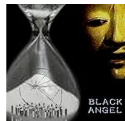
2013 Black Angel