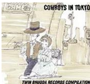
1998 (USA) COWBOYS IN TOKYO Zettaimu & indie bands from Texas