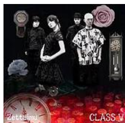
2012 Class Five