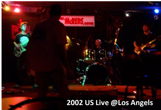
2002 US Live @Los Angeles