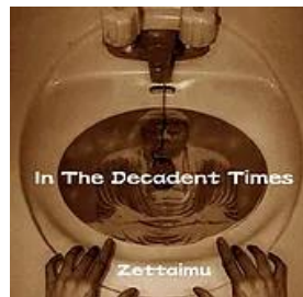
1998 (CD) In The Decadent Times Zettaimu's 2nd album