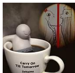
2015 Carry On Till