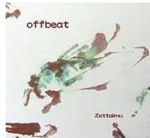
2008 (CD-R) offbeat Zettaimu's best album