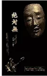
1991 (Cassette) Zettaimu Live! Zettaimu's live recording