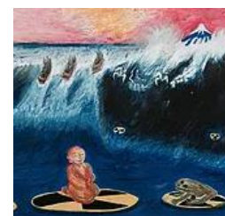
2017 On Sowaka