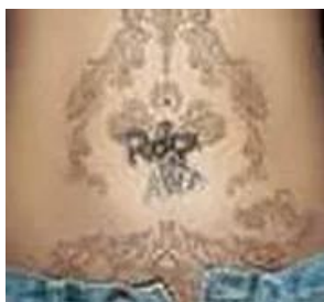
2006 (Singapore) ROCK IN ASIA Zettaimu & indie bands from Asia