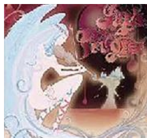
2008 (JAPAN) Jap's Progre Zettaimu & progressive rock bands from Japan