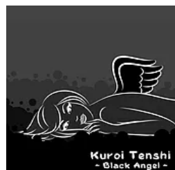
2013 Kuroi Tenshi