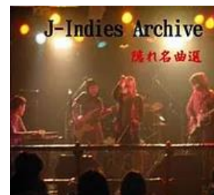
2004 (JAPAN) J-Indies Archive Secret famous tune Zettaimu & cool indie bands from Japan